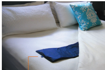
• Bed sensors make it easy to see if your mom got out of bed this morning

Copyright © 2015 Alarm.com. All rights reserved. Alarm.com and the Alarm.com Logo are registered trademarks of Alarm.com.